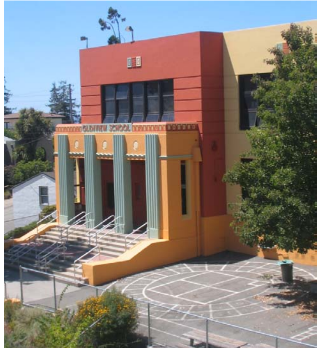
After July 2007