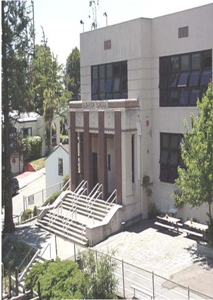
Before July 2007